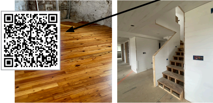
Left: The lower-level kitchen floors after sanding and refinishing. Right: The new stairwell to the lower level.

Fundraising efforts, led by a volunteer campaign cabinet, surpassed $2.6 million toward the $3 million goal in December 2023, with donations from more than 200 individuals and organizations. Join that number by donating at HarborSpringsHistory.org or by scanning the QR code.