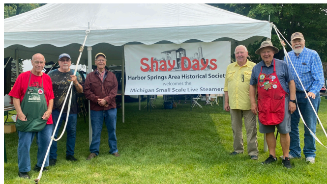
Members of the Michigan Small Scale Live Steamers group pose in front of their tent at Shay Days 2023. Thank you for 25 years of service!