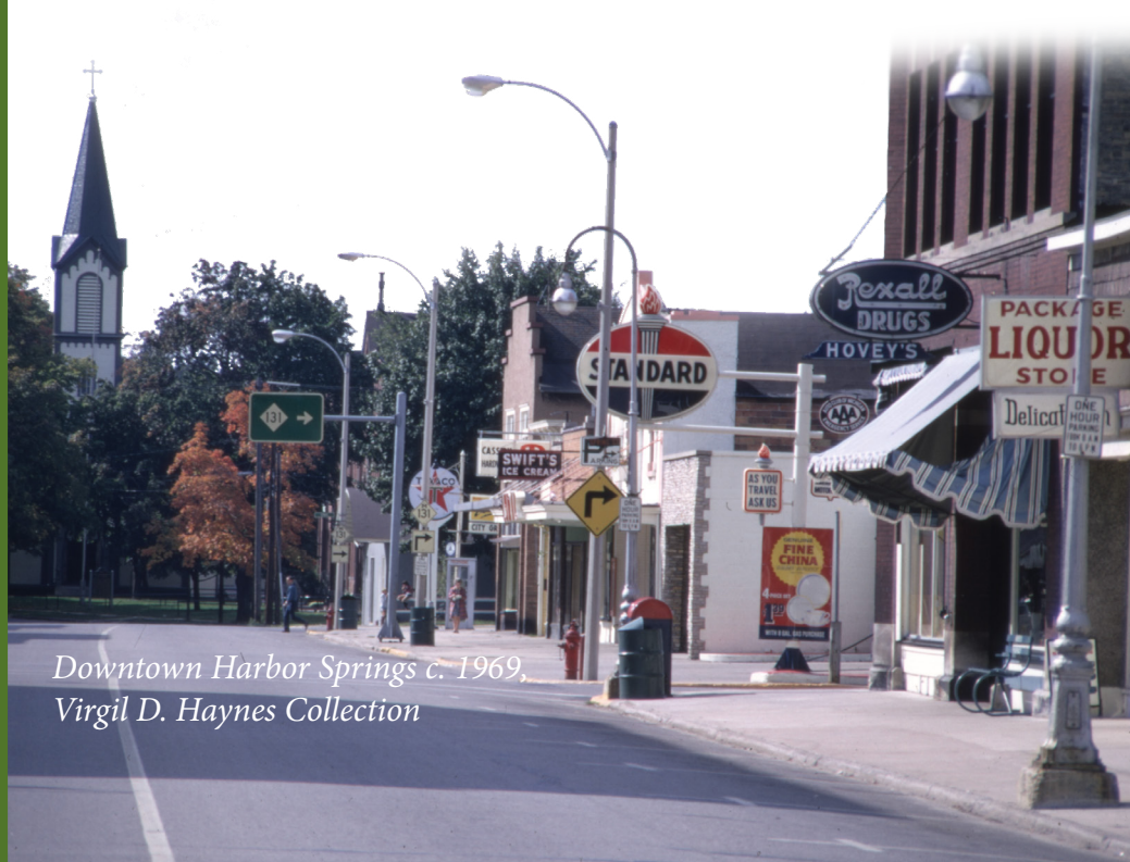
Downtown Harbor Springs c. 1969

Add staff to support growth objectives. Maintain a dynamic compensation and benefit structure to ensure fair and competitive employee packages, and establish and monitor an organizational succession plan.