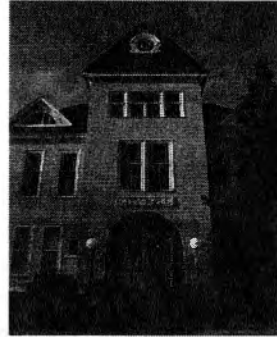
Building today

A vision to guide the project is adopted ~ "To create an inviting and memorable historic destination where visitors of all ages can understand and appreciate the distinctive heritage of Harbor Springs."