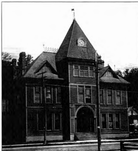
Historic City Hall at the turn of the century.

Please join us for our annual update about the historical society, election of new trustees and unveiling of the plans for the future Harbor Springs History Museum. The post card book will be available for pick-up and sale. A tour of the Historic City Hall will follow the meeting.