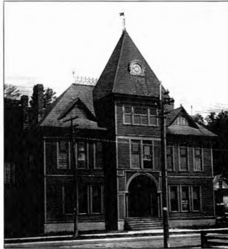
Historic City Hall at the turn of the century.

Please join us for our annual update about the historical society, election of new trustees and unveiling of the plans for the future Harbor Springs History Museum. The post card book will be available for pick-up and sale. A tour of the Historic City Hall will follow the meeting.